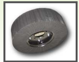
Solid Laminate Tires