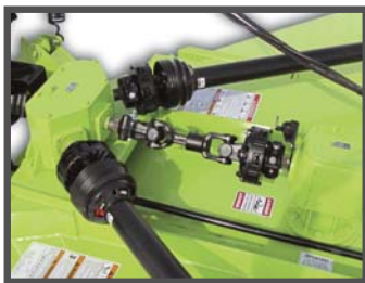
Heavy duty drive system for peak performance