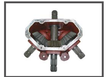
260hp heavy duty splitter box with 1 3/4" splined shafts