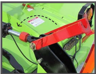
Single center lock up system