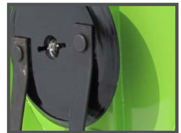
7 gauge spun formed stump jumper pans