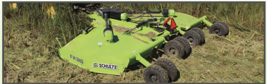
FX-318 mowing Cattails