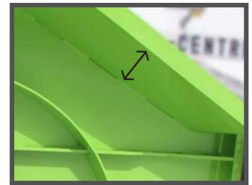
13 5/8" frame depth for maximum material flow