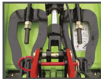
Dual levelling rods with floating hitch