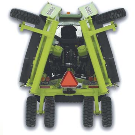
Ultra Narrow Transport Width