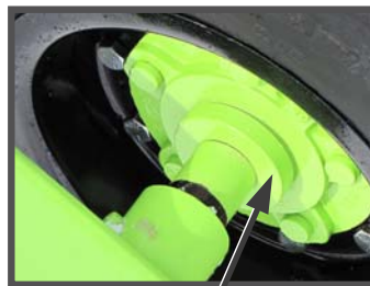
Metal seal guards on 517 hubs